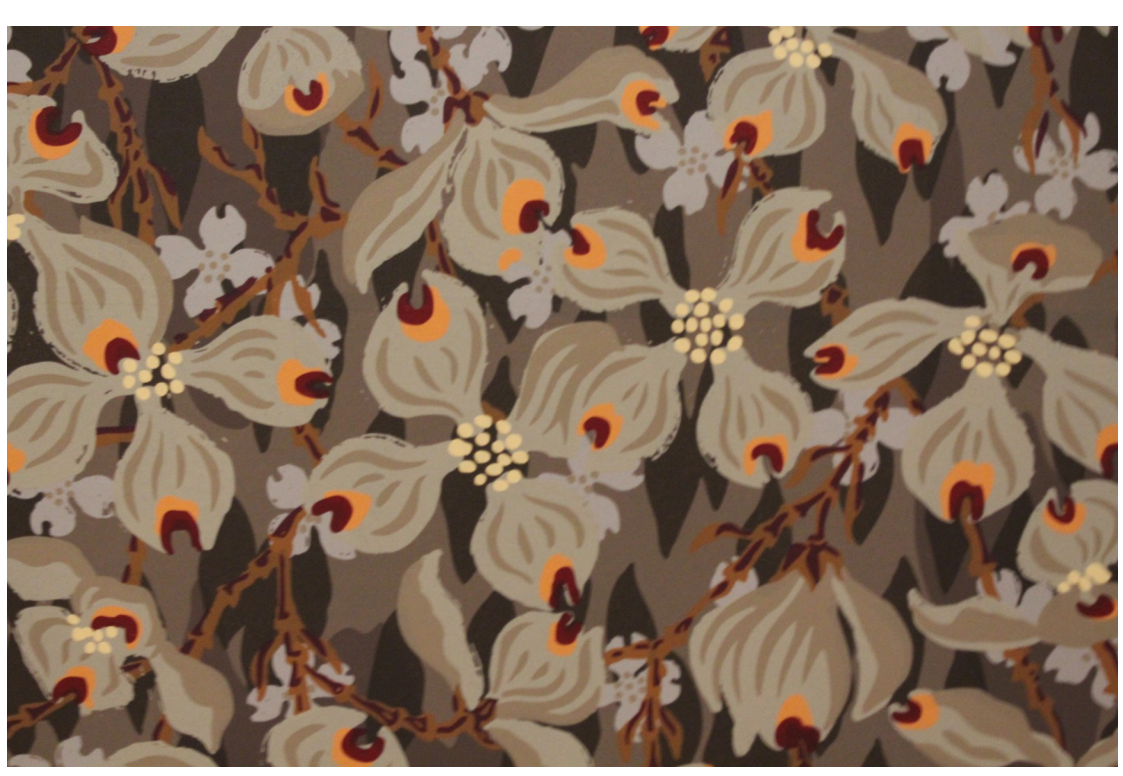
-Toni Liles, Gr. 11