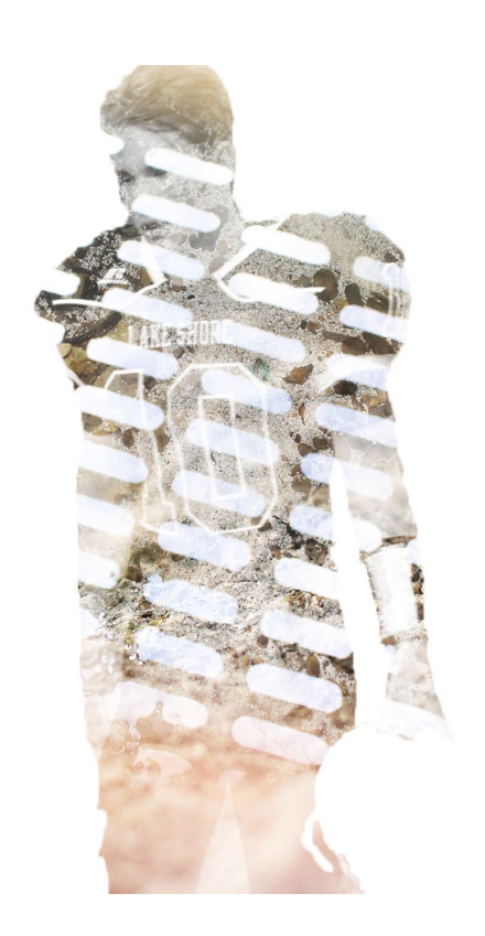
-Cameron Stacey Gr. 11