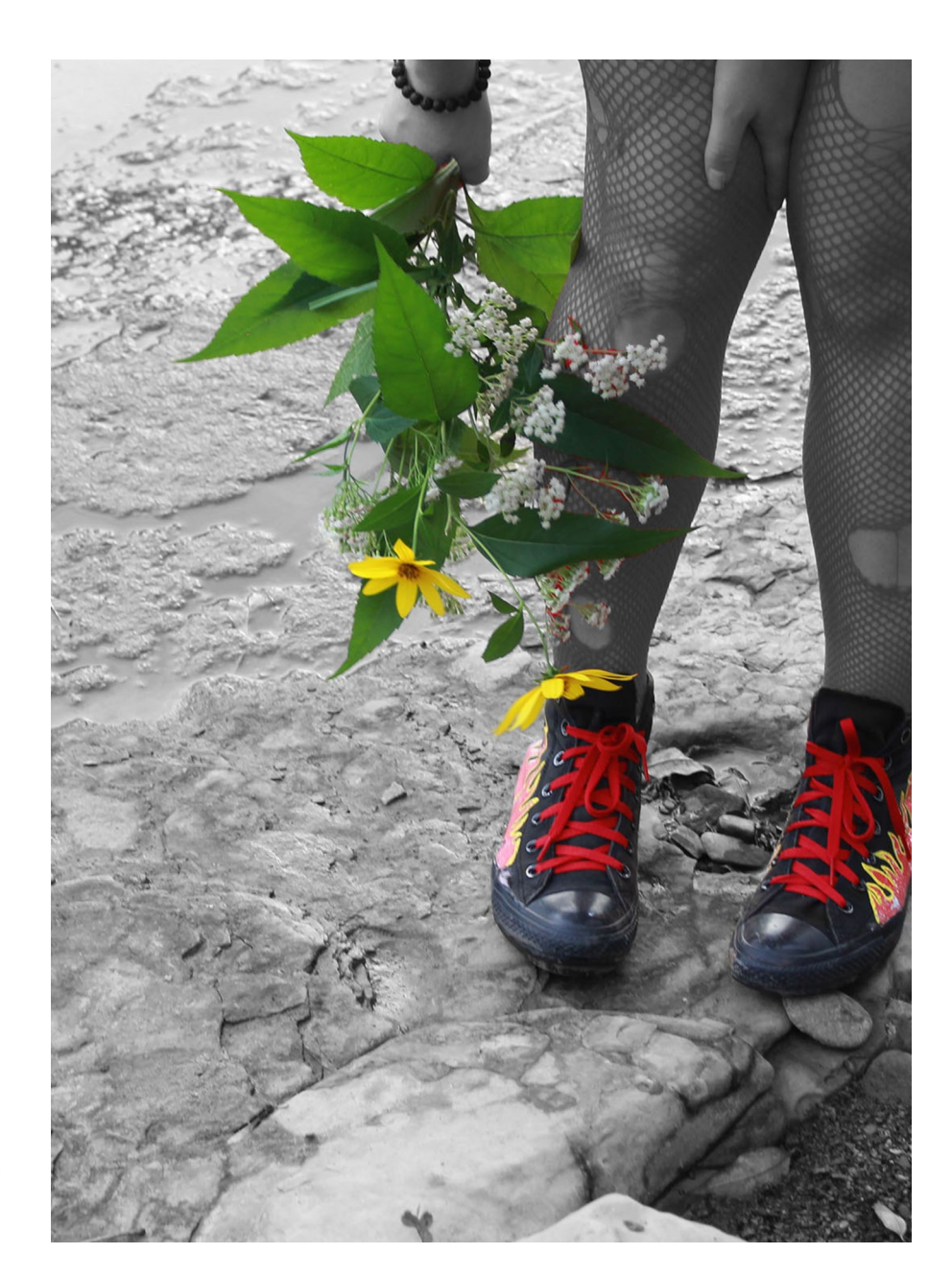
- Toni Liles, Gr. 11