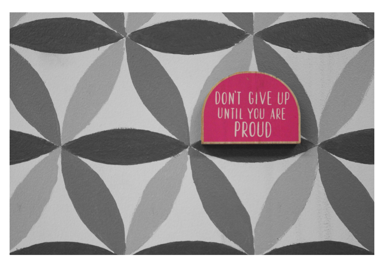
-Holly Weston, Gr. 11