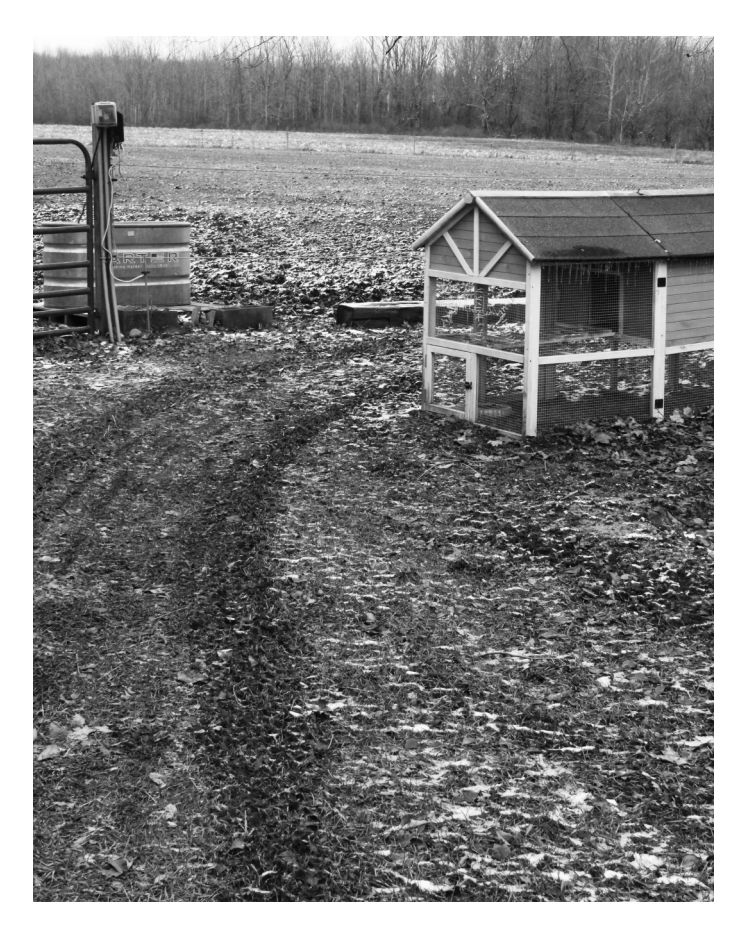
-Ashley Klepp, Gr. 12