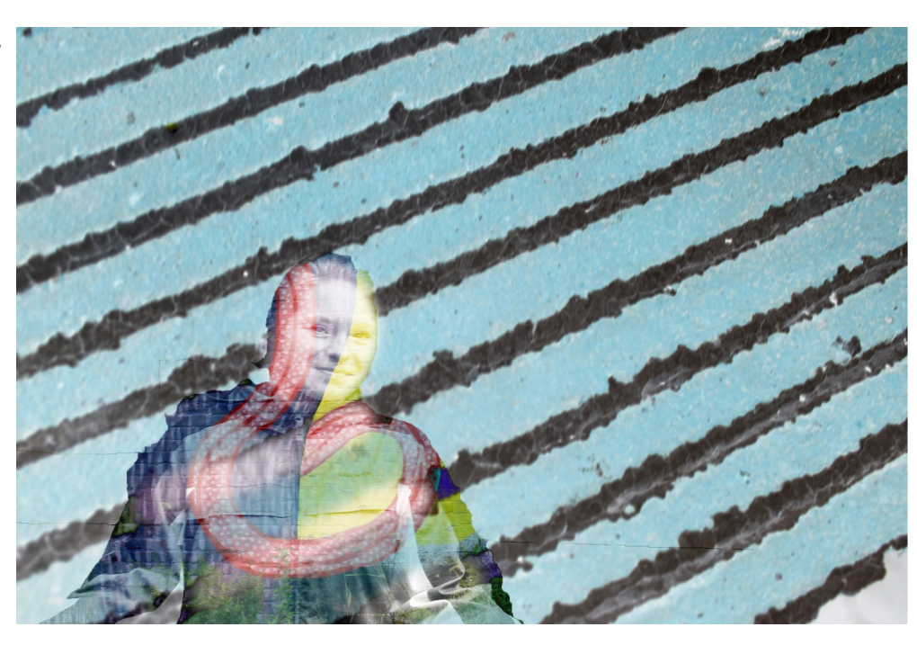
"Kindness"- it's the thing with eyes That others hope to see-To show the world the good Even though there is bad going on-