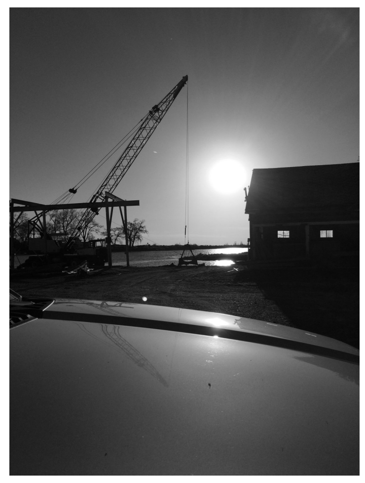
-Kyle Killian, Gr. 12

The unattainable sky lies just beyond reach Stretching stretching Never may I reach it The shimmering diamonds taunt me In their darkened surroundings The glorious moon shall never I touch