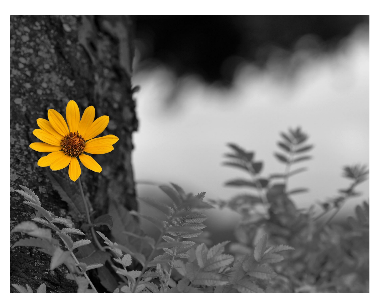
-Kaylee Peacock, Gr. 12